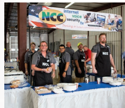
NCC Employees serving free meal.