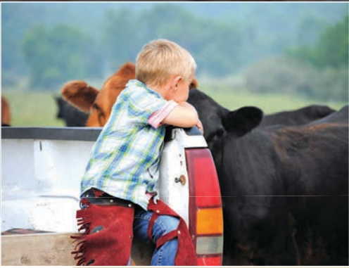
Powers Lake