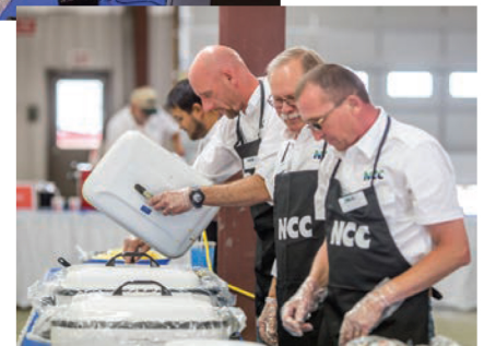
NCC Employees serving free meal.