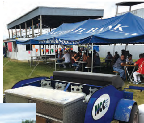
NCC provided and served a BBQ meal at the Burke County Fair.