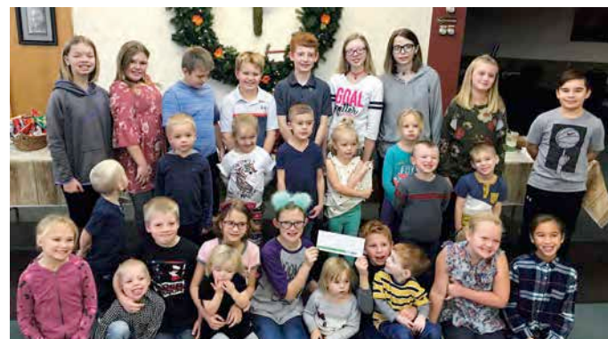
Children at First Lutheran Church in Tioga.